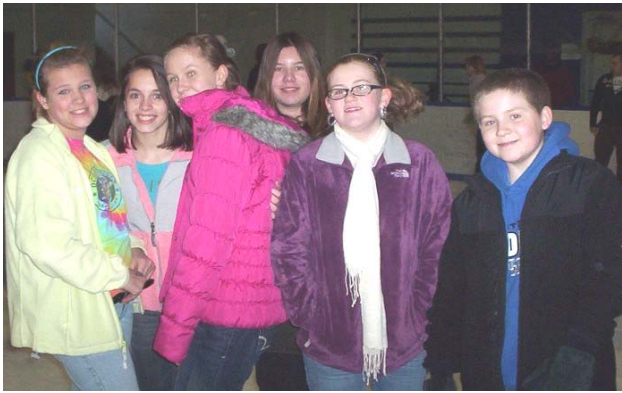
MIDDLE SCHOOL ICE SKATING CREW

If you missed out on any of these activities in January, don't fret there's always plenty going on! Just check out the Newsletter and watch the Weekly Sheet for upcoming activities – and JOIN IN THE FUN!