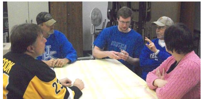
WOH "Casserole Club" Game Night