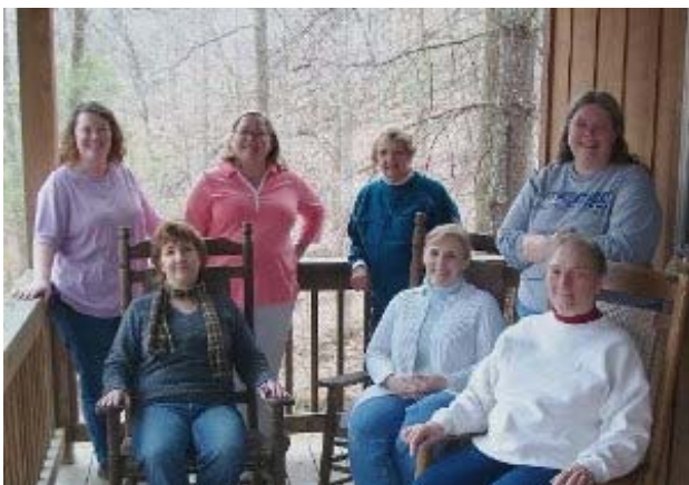
WOH Chic's Winter Retreat at Aldersgate