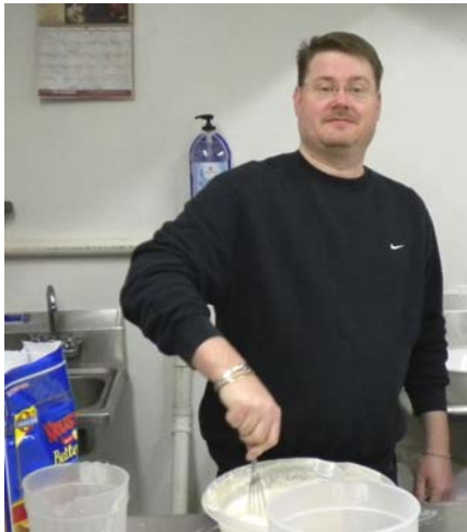
The WOH Crew at Catholic Action Center Breakfast