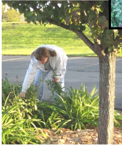
Fall Cleanup in Brin's Garden