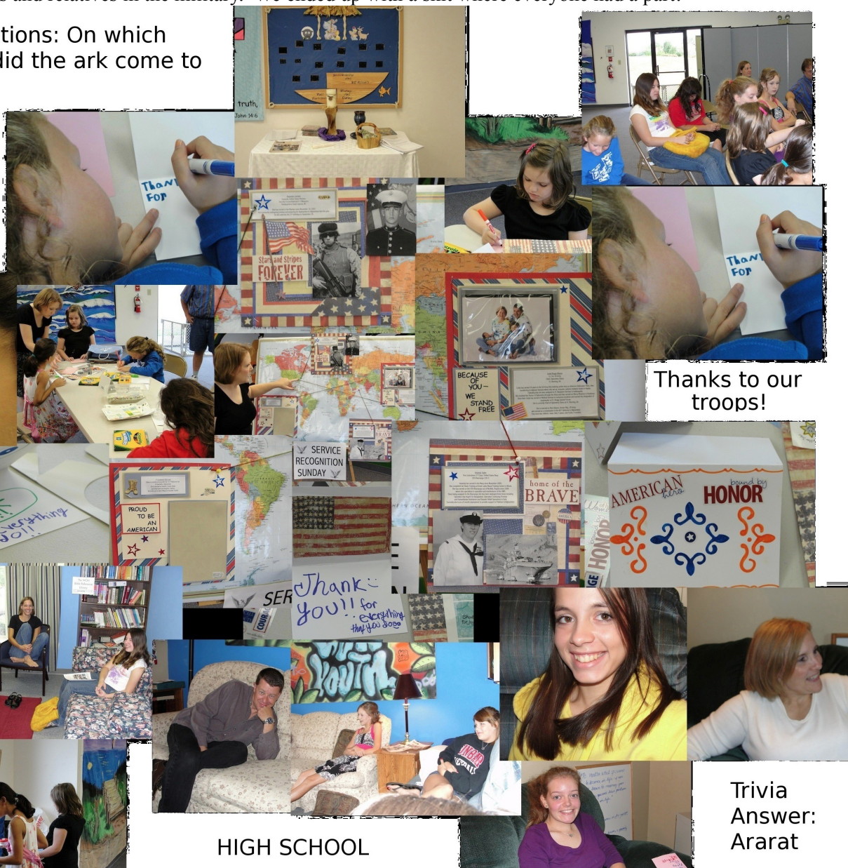
Thanks to our troops!

Full Participation: Jesus, the boy with the food, the disciples... Our military... Our children thanking the military... Youth and adult leaders... Children planning a skit!!